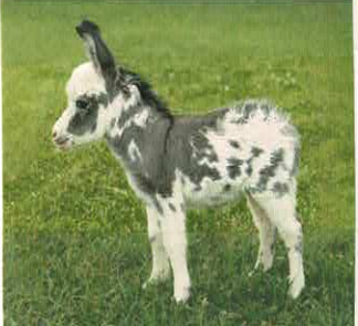
HHAA Chill Bumps 2.jpg

The American Donkey and Mule Society, PO Box 1210, Lewisville TX 75067 www.lovelongears.com/ (972) 219-0781 The American Donkey and Mule Society is not responsible for errors in information submitted to the registry.